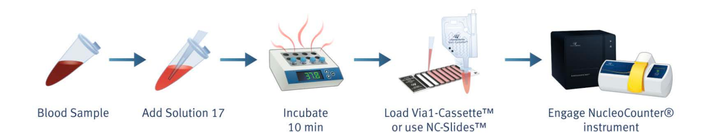
Figure 1: Fast Determination of Cell Count and Viability of Nucleated Cells from Whole Blood. Quickly incubate the blood sample with Solution 17 and directly load the Via1-Cassette<sup>™</sup> or NC-Slide<sup>™</sup> for analysis using the NucleoCounter<sup>®</sup> instruments.

Hematology analyzers are often used to count and characterize blood cells; however they can be complex and expensive to operate. The NucleoCounter<sup>®</sup> instruments offer an easy and fast protocol to precisely determine viability and cell count directly from whole blood. Adding Solution 17 to a blood sample followed by a short incubation time lyses the erythrocytes allowing the diluted blood sample to be analyzed by the NucleoCounter<sup>®</sup> instruments using the Via1-Cassette<sup>™</sup> or the NC-Slides<sup>™</sup> (Figure 1). NucleoCounting is fast and inexpensive, and can be used for a broad range of counting applications, e.g. in adoptive immunotherapies and for counting bone marrow-derived mesenchymal stem cells.