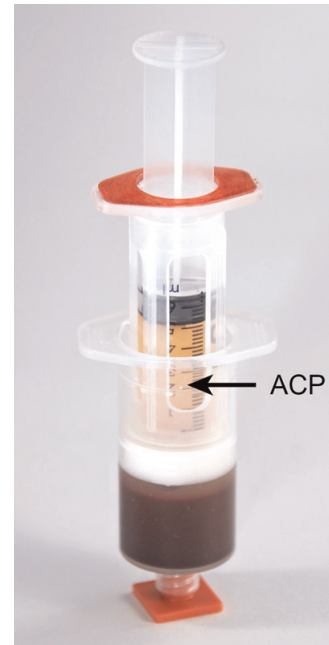
Figure 2. Image of syringe components with blood separated into the leukocyte-rich red blood cell pack and final injection syringe containing autologous conditioned plasma (ACP).

In a feasibility trial, the safety of a medical product concerns the medical risk to the subject, which is usually